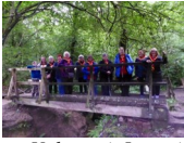
Volume 1, Issue 1 - August 2021