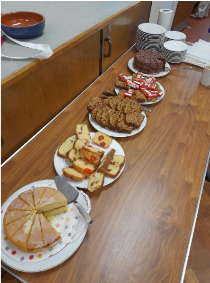
Cakes provided by EG Trefoil members