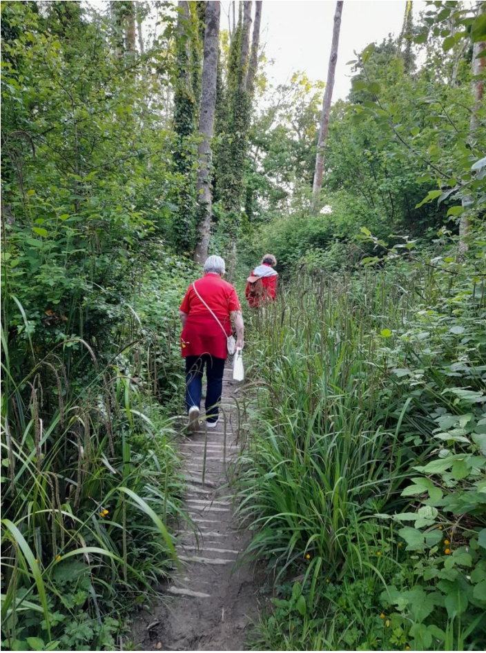
Walking through woodland