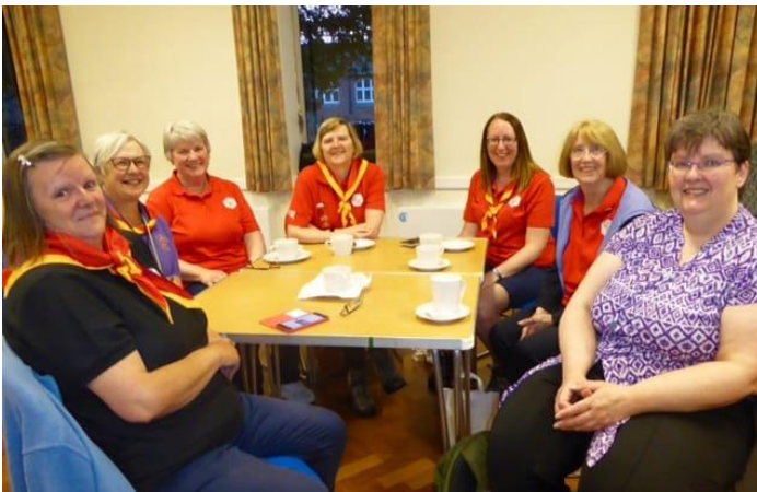
The seven participants enjoying refreshments